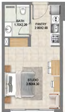
TYPE 05 ( Sixth Floor ) AREA:314.95 Sq. Ft.