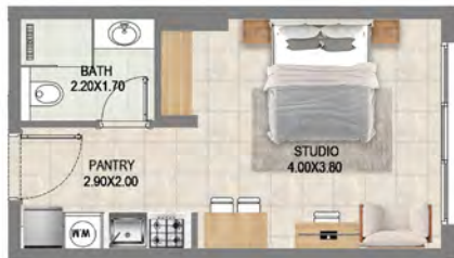
TYPE 08 ( Sixth Floor ) AREA:304.62 Sq. Ft.