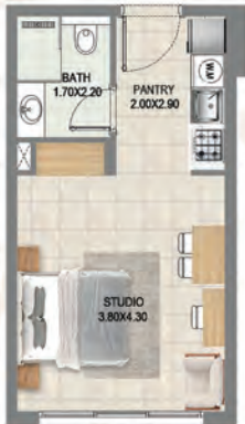
TYPE 05 AREA:314.95 Sq. Ft.