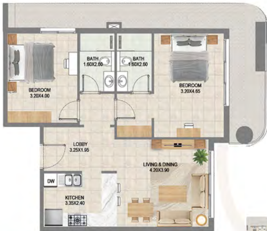
TYPE 09 ( Sixth Floor ) AREA:1462.71 Sq. Ft.