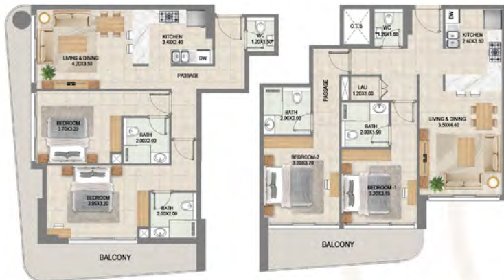
TYPE 03 ( Sixth Floor ) AREA:1131.29 Sq. Ft.