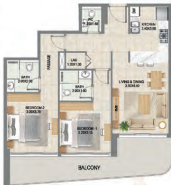
TYPE 04 AREA:1085 Sq. Ft.