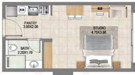
TYPE 09 AREA:332.60 Sq. Ft.