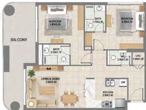
TYPE 14 AREA:1114.28 Sq. Ft.