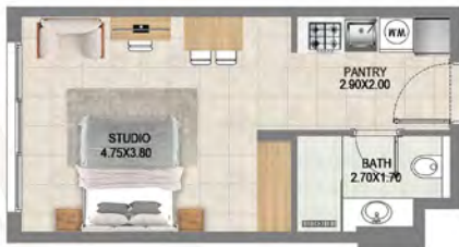
TYPE 01 AREA:328.41 Sq. Ft.