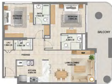
TYPE 10 AREA:1114.06 Sq. Ft.