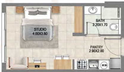
TYPE 02 AREA:304.62 Sq. Ft.