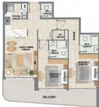
TYPE 06 AREA:1079.51 Sq. Ft.