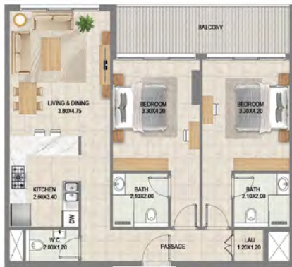
TYPE 12 AREA:1108.14 Sq. Ft.