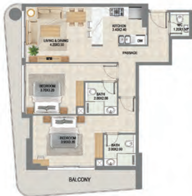
TYPE 03 AREA:1131.29 Sq. Ft.