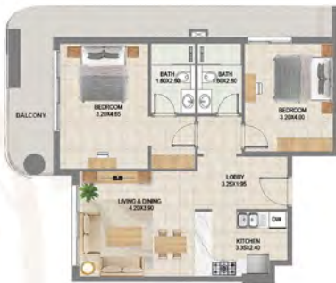
TYPE 01 ( Sixth Floor ) AREA:1458.51 Sq. Ft.