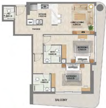
TYPE 07 AREA:1131.61 Sq. Ft.