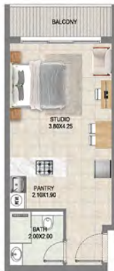
TYPE 11 AREA:416.13 Sq. Ft.