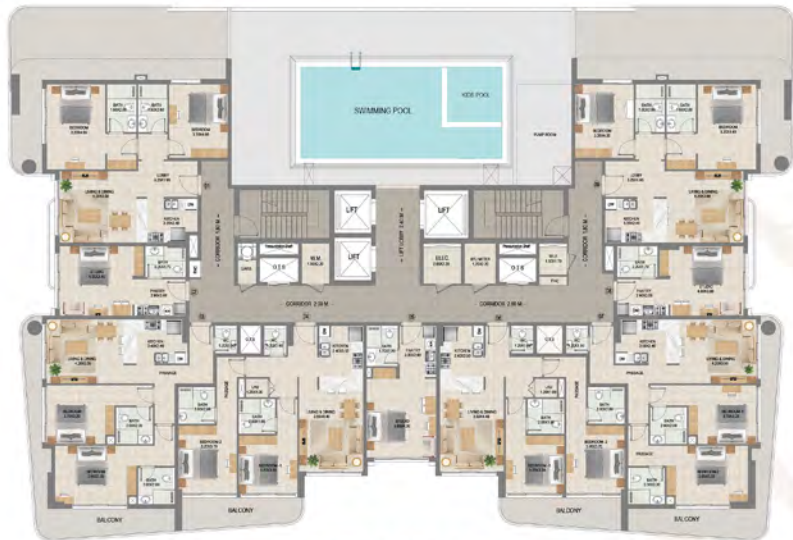
SIXTH FLOOR PLAN