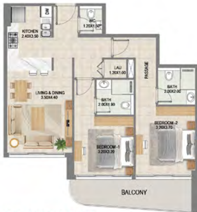
TYPE 06 ( Sixth Floor ) AREA:979.62 Sq. Ft.