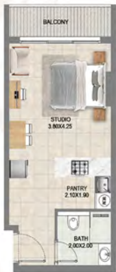
TYPE 13 AREA:416.13 Sq. Ft.