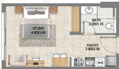
TYPE 02 ( Sixth Floor ) AREA:304.62 Sq. Ft.