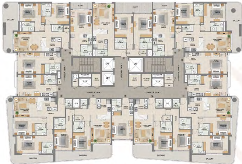
TYPICAL FLOOR ( 01,03 & 05 ) PLAN