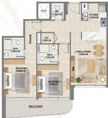
TYPE 04 ( 2 & 4th Floor ) AREA:985.11 Sq. Ft.