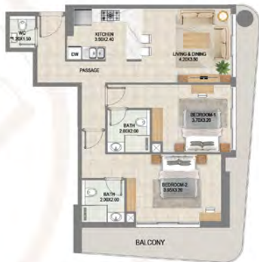
TYPE 07 ( Sixth Floor ) AREA:1131.29 Sq. Ft.