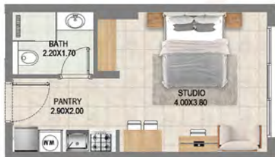
TYPE 08 AREA:304.62 Sq. Ft.