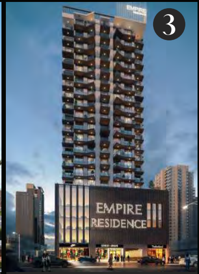
EMPIRE RESIDENCE JUMEIRAH VILLAGE CIRCLE