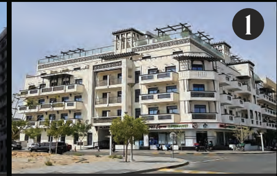
PLAZZO RESIDENCE JUMEIRAH VILLAGE TRIANGLE

EMPIRE DEVELOPMENTS CRAFTING HOMES CREATING