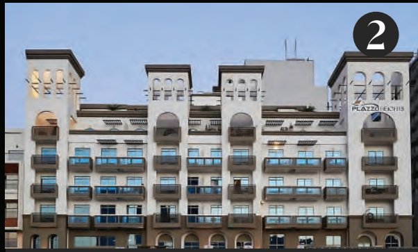
PLAZZO HEIGHTS JUMEIRAH VILLAGE CIRCLE