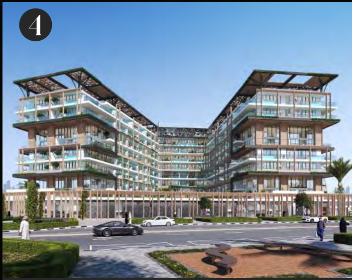
EMPIRE ESTATES ARJAN